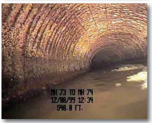
A closed-circuit camera provides crews with an in-depth look at the condition of a sewer during an inspection.