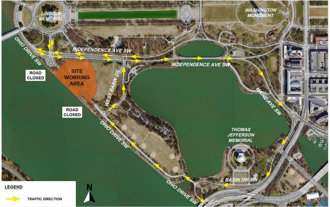
Map B: Ohio Drive Traffic Detour –June 17, 2024 - October 15, 2024