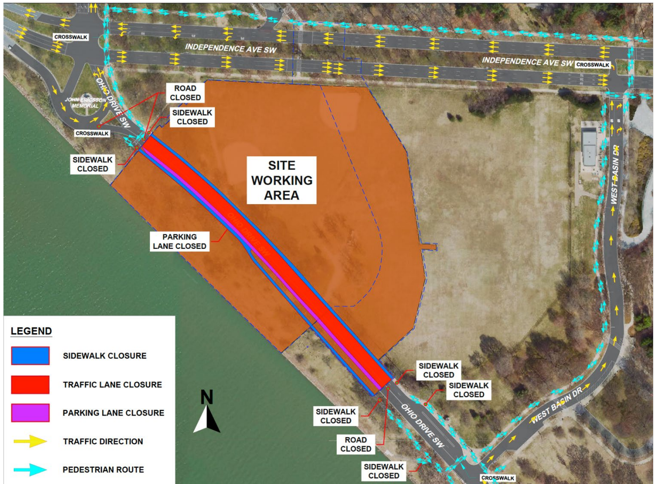
Map A: Traffic (yellow arrows) and Pedestrian (blue arrows) Detour – June 17, 2024 - October 15, 2024