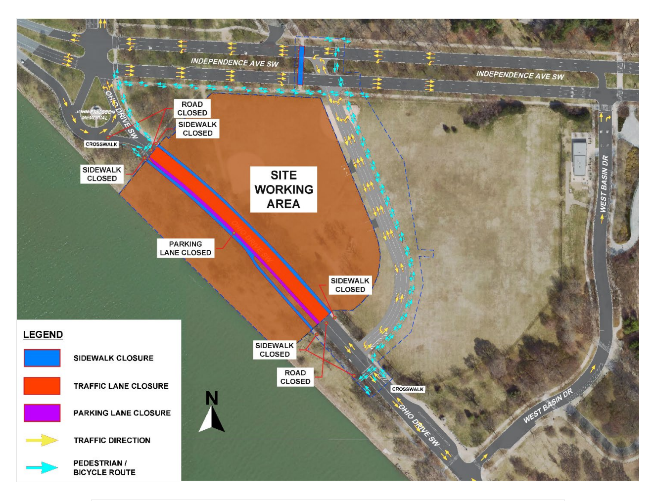
Map C: Relocated Ohio Drive Configuration begins October 15, 2024 – Late 2030

Potomac River Tunnel (PRT) WPP Traffic Advisory July 2024 Page 2