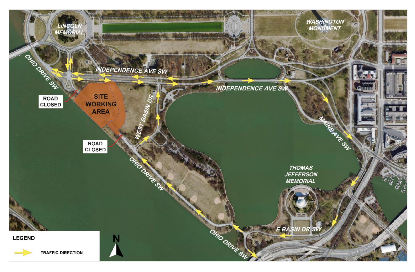
Map B: Ohio Drive Traffic Detour –June 17, 2024 - October 15, 2024